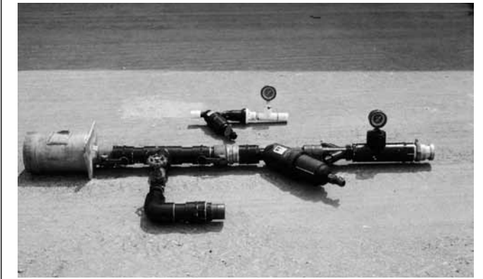
Screen filters, pressure regulators, and pressure gauges

Watering several fields or sections of fields from one water source can be accomplished by using automatic or manually operated valves to open and close various zones. Either hand-operated valves (gate or ball type) or automated electric solenoid valves (using a time clock, water need sensor, or automatic computer controller box) can be used to control irrigation zones. It is also recommended that a water meter be installed to monitor total water usage and flow rate in the system. A backflow/anti-siphon valve is also necessary if you use a well or municipal water source or when injecting fertilizers or chemicals into the system.