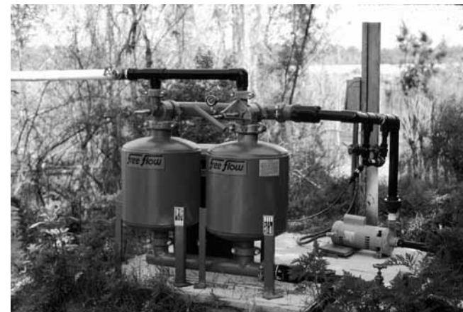
Sand filter, pump, and fertigation unit

Media filters are the most common filters used in commercial vegetable production. Ranging from 14 to 48 inches in diameter, they are usually installed in pairs. Media filters are expensive, heavy, and large, but they can clean poor-quality water at high flow rates. In a media filter, 12 to 16 inches of media (sand or crushed rock) act as a three-dimensional filtering agent, trapping particles within the top inch or two of media. As the media fills with particulate matter, the pressure drop across the media tank increases, forcing water through smaller and fewer channels. This will eventually disable a media filter, requiring that clean water from one tank be routed backwards through the dirty tank to clean the media. This "backwashing" requires exact flow rates to make the media "dance" and be thoroughly cleaned. Large, commercial-sized filters require electronic controls and hydraulic valves to route the water. Typically, the pressure drop across a clean media tank is 2 to 3 psi. When the pressure differential across the media filters reaches a given level, typically 5 to 8 psi higher than when the tanks are clean, it is time to backflush the filters.