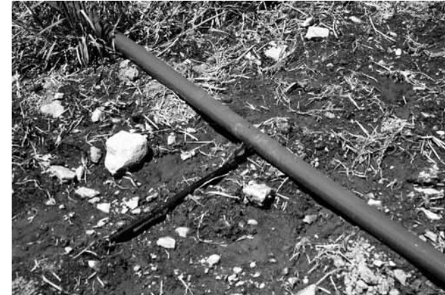
Vinyl lay flat hose with connector and drip tape

Sub-mainline (header): It is common to use vinyl “lay flat” hose (polyethylene pipe) as the sub-mainline (header line). This hose is durable and long lasting, and it lies flat when not in use so that equipment can be driven over it. The lay flat hose, connectors, and feeder tubes are retrieved after each growing season and stored until the following year. Since polyethylene pipe is somewhat rigid, it is not easily rolled up at the end of the season.