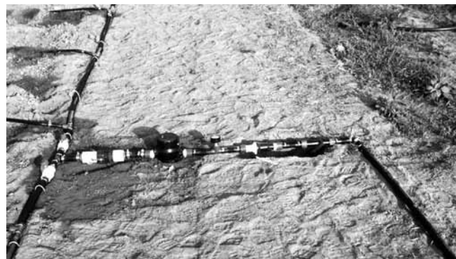
Irrigation mainline with screen filter, pressure regulator, pressure gauge, and water meter connected to sub-main

Mainline distribution to field: Underground polyvinyl chloride (PVC) pipe or above-ground aluminum pipe is used to deliver water from its source (pump, filtration system, etc.) to the sub-mainline (header line).