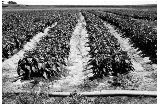
Drip irrigation of bell peppers

This publication was developed by the Small-scale and Part-time Farming Project at Penn State with support from the U.S. Department of Agriculture-Extension Service.