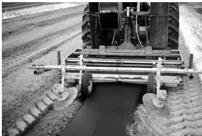
Laying plastic mulch and drip tape

*Only plastic mulch and drip irrigation components are included. The field is assumed to be level with an adjacent surface water supply (pond). The filters designed in this system are capable of irrigating one acre at one time. The system contains media filters, a venturi injector, and a 5.5-hp engine and pump. Additional equipment to consider includes water meters. Although the base equipment used in this example will sufficiently handle more than one acre, carefully consider the number of zones and the time required to irrigate additional zones before purchasing equipment. No sales tax, freight, or field labor was included in these estimates.