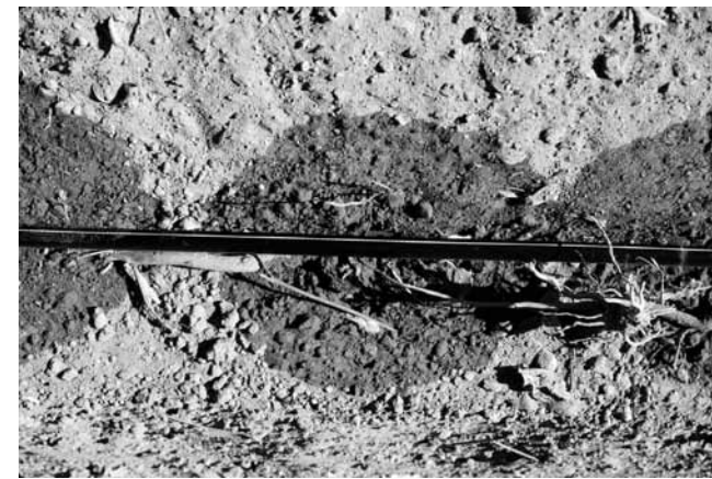
Drip tape and wetting pattern

Connectors/couplings: Plastic connectors or couplings are used to connect the drip line to the sub-main.