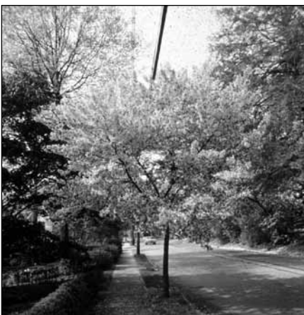
Utility-compatible flowering crabapple tree