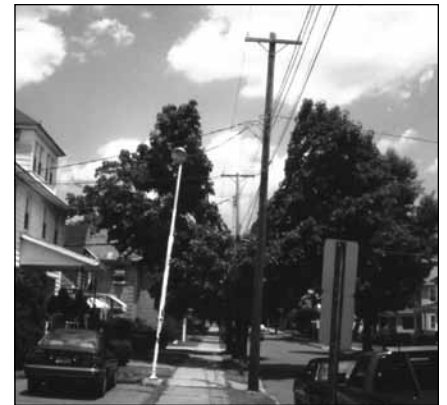
View from down the curb

■ Trees growing directly under conductors appear U or V shaped. Trees growing alongside a conductor may appear L shaped from side pruning. At first the tree may appear misshapen, especially if you are looking down the curb line, but that changes over the years as the tree leafs out and grows in. Viewed from directly across the street, the form of a tree that has been pruned by directional pruning appears natural, with lines running through it. Directionally pruned trees stay healthier than topped trees, have a much better form, and require less pruning in the future because of the use of reduction cuts.