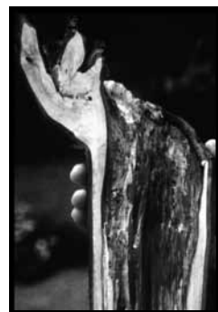
Internal decay caused from topping a tree