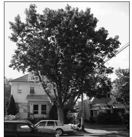
View from across the street